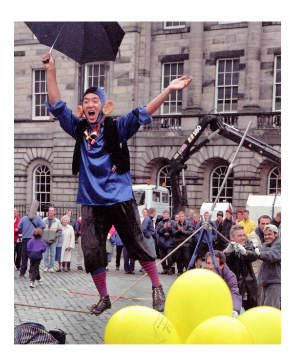
Figure 1: A Street Performer at the Edinburgh Fringe on the Royal Mile.

gone through the photos twice, participants were asked to name or describe their groups. Next, participants were asked to decide which photos to keep and which to delete. For 5 of the keep decisions and 5 of the delete decisions, participants were asked for their reason. Group 4 did not see their photos on the day they were taken.