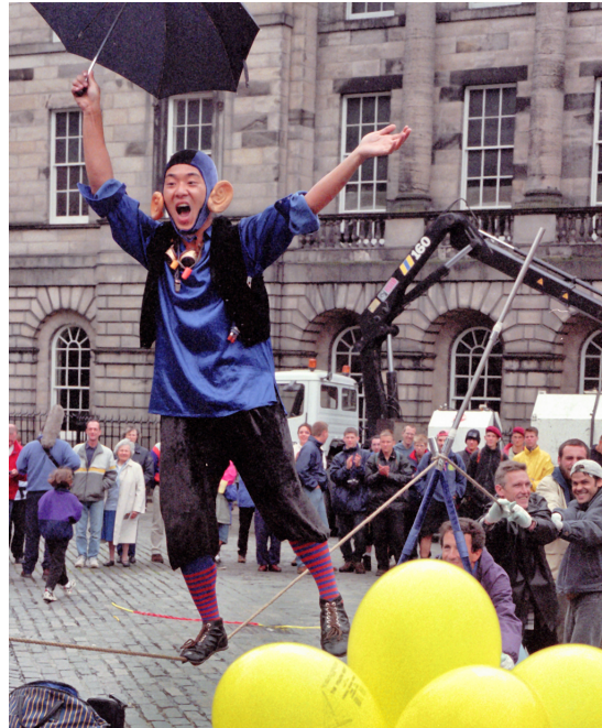
Figure 1: A Street Performer at the Edinburgh Fringe on the Royal Mile.

gone through the photos twice, participants were asked to name or describe their groups. Next, participants were asked to decide which photos to keep and which to delete. For 5 of the keep decisions and 5 of the delete decisions, participants were asked for their reason. Group 4 did not see their photos on the day they were taken.